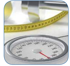
Strive for a Healthy Weight