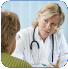
Be Involved in Your Health Care