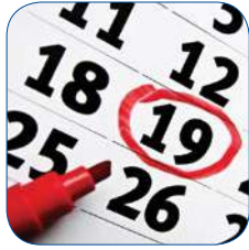
Be Tobacco Free