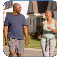
Be Physically Active